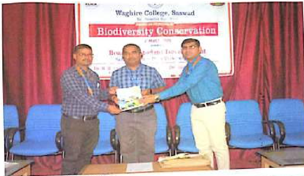
Felicitation of the guests