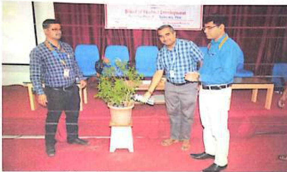
Inauguration of the workshop