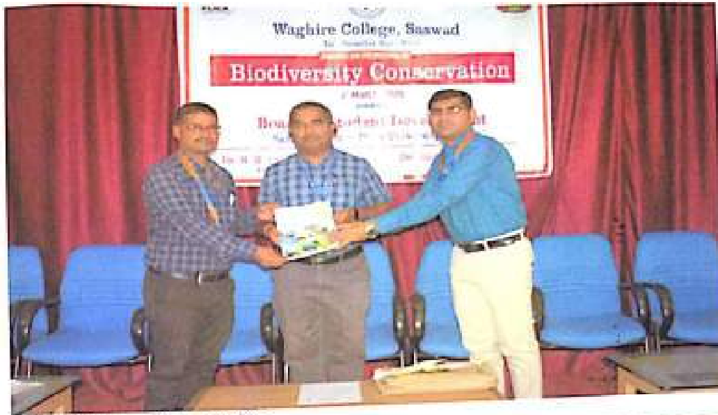
Felicitation of the guests