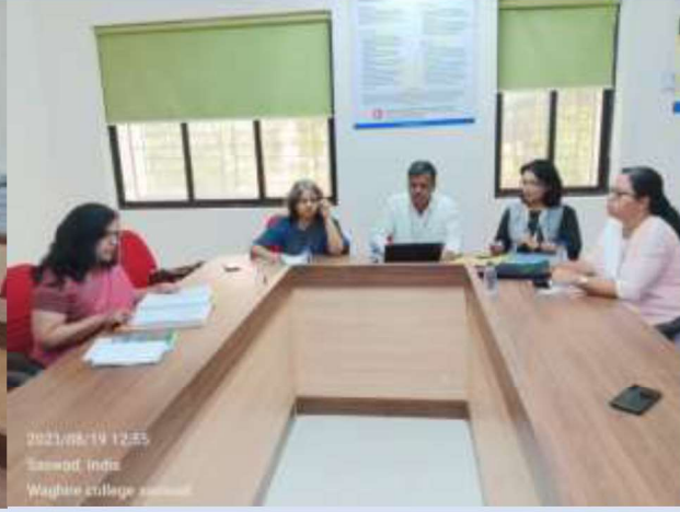
Verification of data with IQAC Committee members, ICC Chairman and Student Welfare Committee Chairman